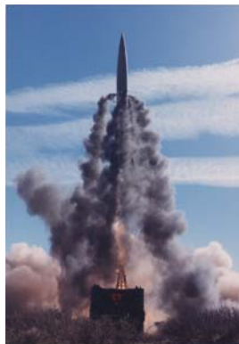
Proven, reliable performance in hostile missile launch environments