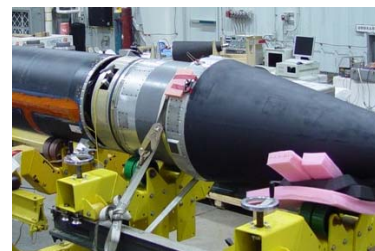
Wrap-around multi-band microstrip and patch antenna systems