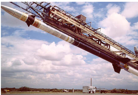
Decades of successful telemetry, flight termination system, and other command up-link antenna performance during hundreds of missions.

NMSU's experienced personnel will apply proven designs and techniques to satisfy flight test requirements whenever possible. New technology, techniques, and resources developed by NMSU staff also are routinely applied to modify these proven designs or develop new systems for satisfaction of new flight test requirements as needed. Modeling and testing are conducted as needed to assure that antenna systems provided for flight test applications will satisfy critical performance and survivability criteria.